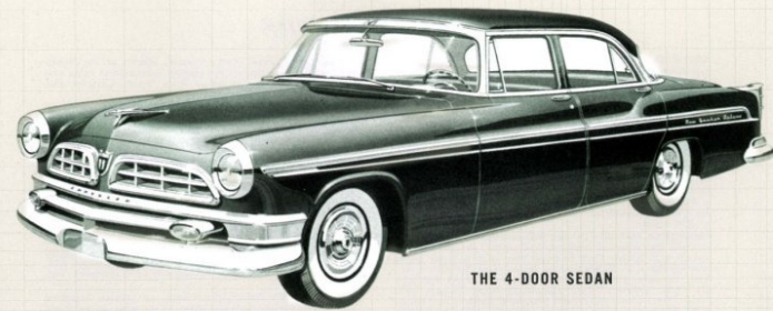
THE 4-DOOR SEDAN