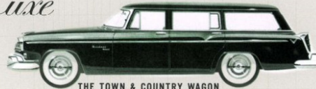
THE TOWN & COUNTRY WAGON