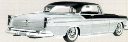
THE ST. REGIS