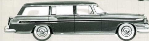
THE TOWN & COUNTRY WAGON