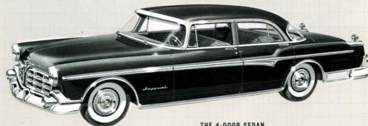
THE 4-DOOR SEDAN

For the 1955 Models, Chrysler designers, engineers, and stylists have created a bold new concept of design that has style, beauty, symmetry and grace, an inherent sense of balance, and a feeling of motion that gives the cars a distinctive and smart appearance quite unlike any other cars on the market today. These smart new cars are all-new—entirely and completely new, from the front grille to the rear-deck design. And also, they are