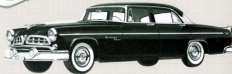
THE 4-DOOR SEDAN