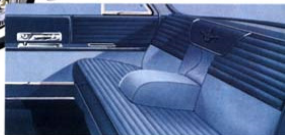
The mood of Imperial interiors is one of richness, comfort and relaxation. Fine fabrics, discretely combined with new-vented fabrics, achieve distinctive effects. Chrome trim is discreetly used to carry out the air of refinement.