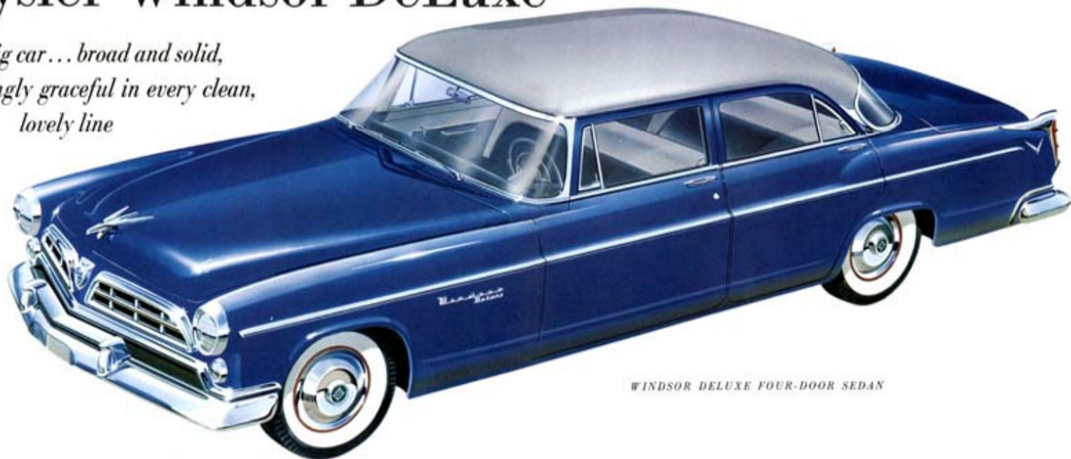
WINDSOR DELUXE FOUR-DOOR SEDAN

... a big car... broad and solid, yet strikingly graceful in every clean, lovely line