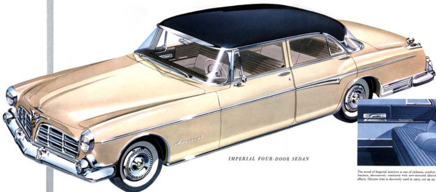
IMPERIAL FOUR-DOOR SEDAN