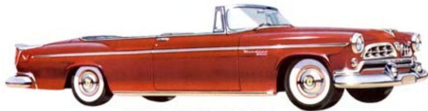
WINDSOR DELUXE CONVERTIBLE