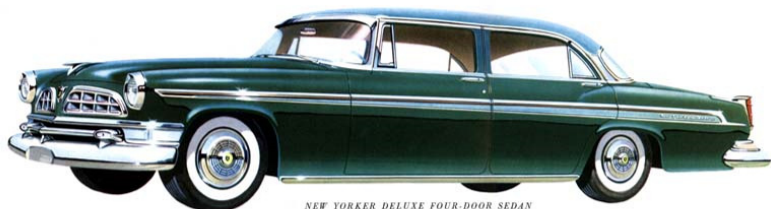
NEW YORKER DELUXE FOUR-DOOR SEDAN