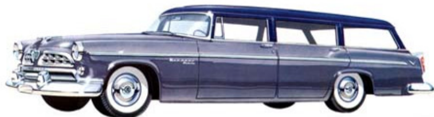
WINDSOR DELUXE ESTATE WAGON