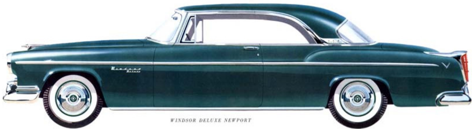
WINDSOR DELUXE NEWPORT