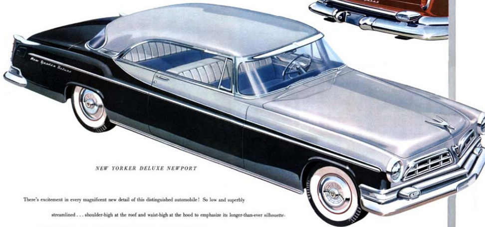
NEW YORKER DELUXE NEWPORT

There's excitement in every magnificent new detail of this distinguished automobile! So low and superbly