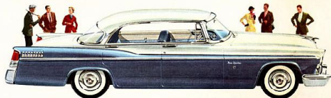
The Four Door Newport Hardtop