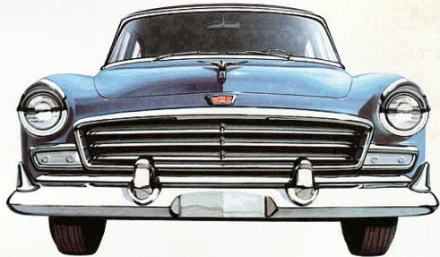
THE Chrysler WINDSOR V8