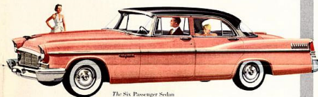
The Six Passenger Sedan