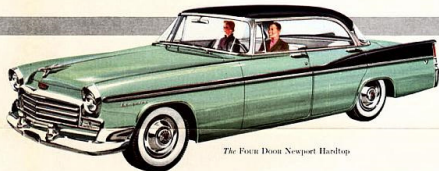
The Four Door Newport Hardtop