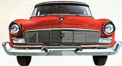
THE Chrysler NEW YORKER V8