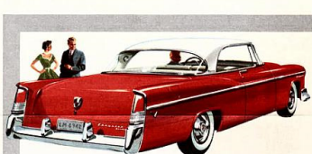
The Two Door Nassau Hardtop