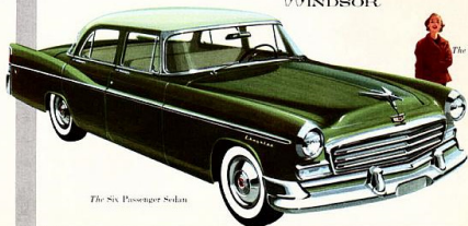
The Six Passenger Sedan