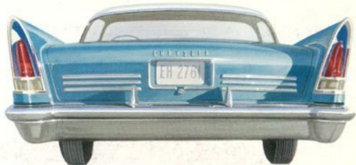
ILLUSTRATION D New Rear Deck Trim