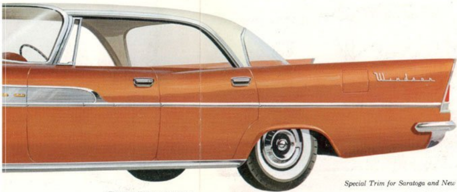
The 1958 Windsor Dartline