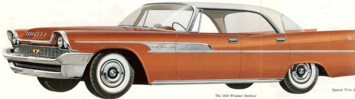
The 1958 Windsor Darline