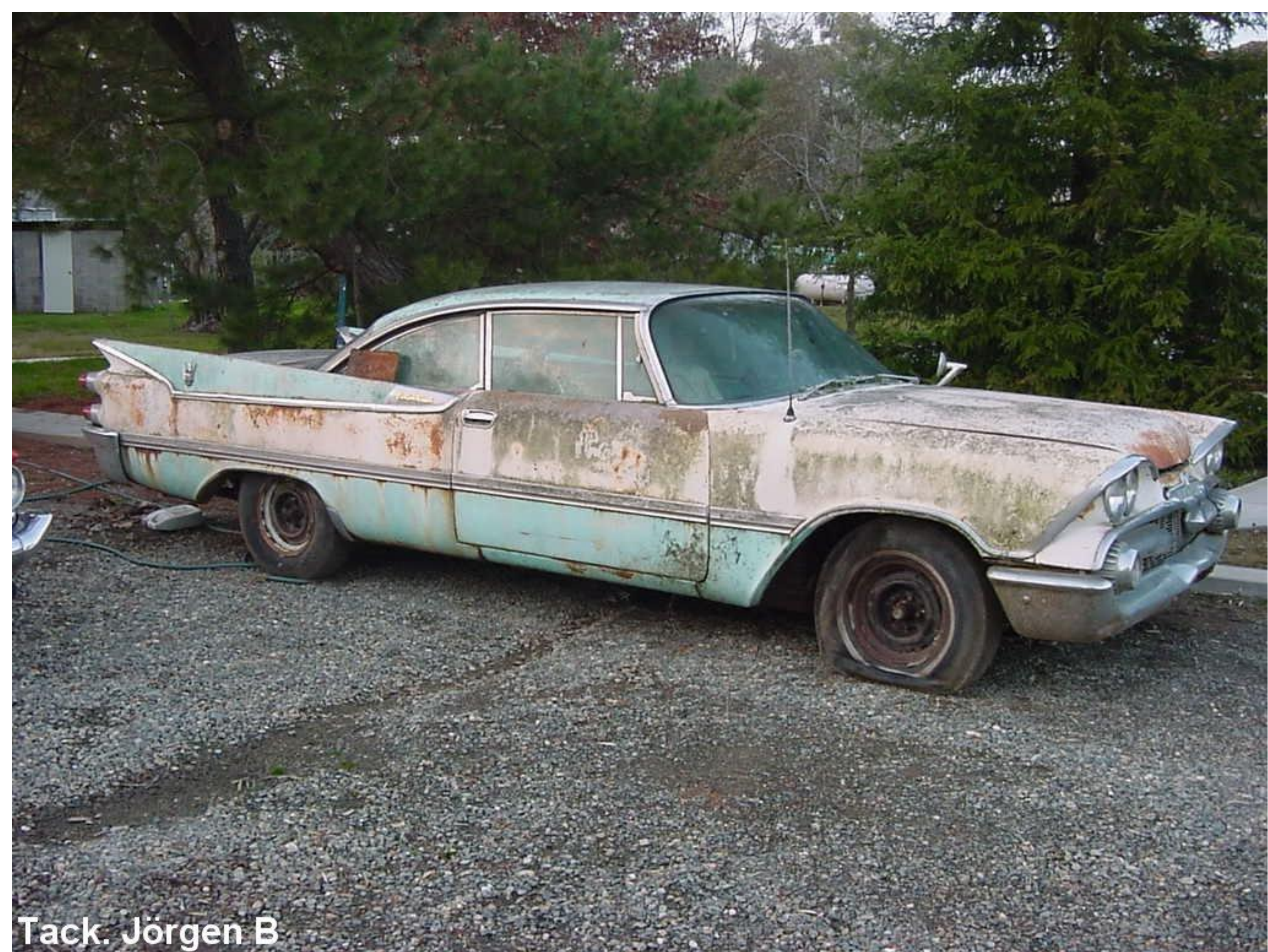
Tack. Jörgen B