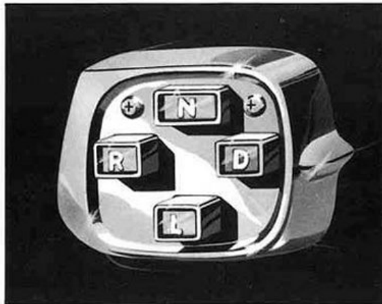
No Gear Shift Lever.

There are many other engineering and design features for your safety, convenience, and comfort. And, so that you will fully appreciate what the Imperial offers, we again suggest that you inspect and drive it at your convenience.