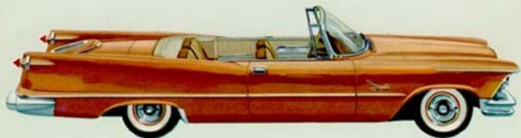
THE IMPERIAL CROWN CONVERTIBLE

take a ride . . . it's an invitation to adventure