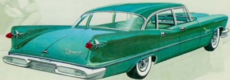
THE IMPERIAL FOUR-DOOR SEDAN

with refinement of detail and fresh, dynamic outline that distinguish the Imperial at first glance . . . The Imperial reaches a new peak in automotive progress with its power, riding comfort and ease of operation. Brilliantly conceived, it's a car we know you want to meet and drive—the finest automobile in the world.