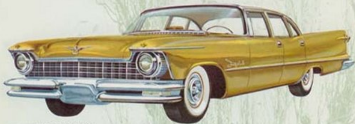
THE IMPERIAL CROWN SEDAN

Always poised for action, the Imperial incorporates the vitality of motion in its graceful lines. Its dramatic concept of the Forward Look includes many design features that instantly identify it as an Imperial: curved windshield and rear window that give the upper structure a long, unbroken curve from front to rear . . . richly appointed, roomy interior . . . gun-sight taillight, now integrated with the canted, upsweeping rear fenders . . . new simulated rear deck fire mount . . . massive bumper design . . . dual headlights optional on all models . . . Just looking at the Imperial is a pleasure. Many have called the new Imperial "the most beautiful car ever designed."