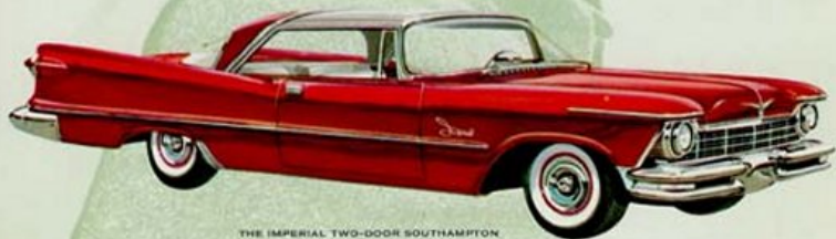
THE IMPERIAL TWO-DOOR SOUTHAMPTON

Under the Imperial's hood crouches a mighty 325-horsepower FirePower engine. Your touch on a button calls it to life, selects the driving range for the amazingly smooth and fast TorqueFite transmission . . . the finest automatic transmission yet developed by automotive engineers. You'll cruise effortlessly along at highway speeds . . . pass swiftly and safely with a surge of power . . . Sharp curve in the road! You round it neatly with fingertip pressure on the steering wheel activating the Full-Time power steering . . . The silky efficiency of an Imperial in action is a joy to experience.