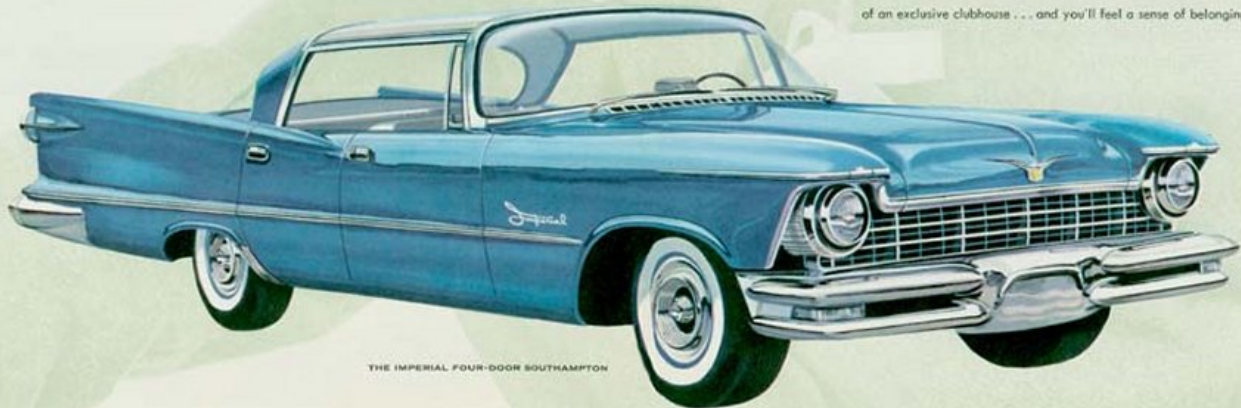
THE IMPERIAL FOUR-DOOR SOUTHAMPTON

This interior has the elegant, spacious atmosphere of an exclusive clubhouse . . . and you'll feel a sense of belonging.