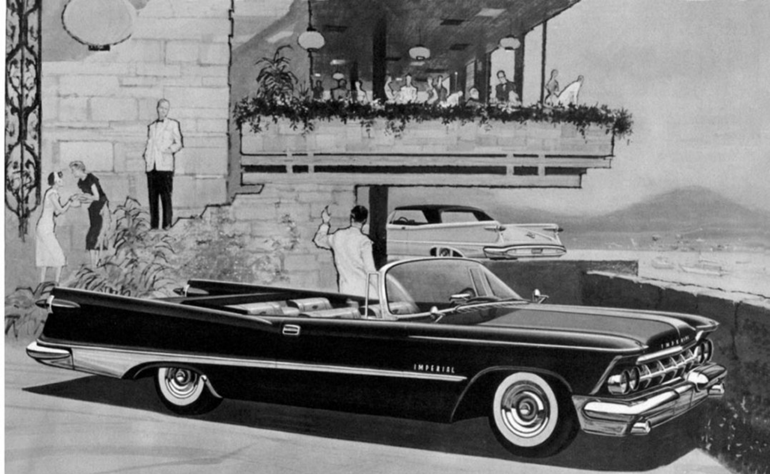
THE IMPERIAL CROWN CONVERTIBLE