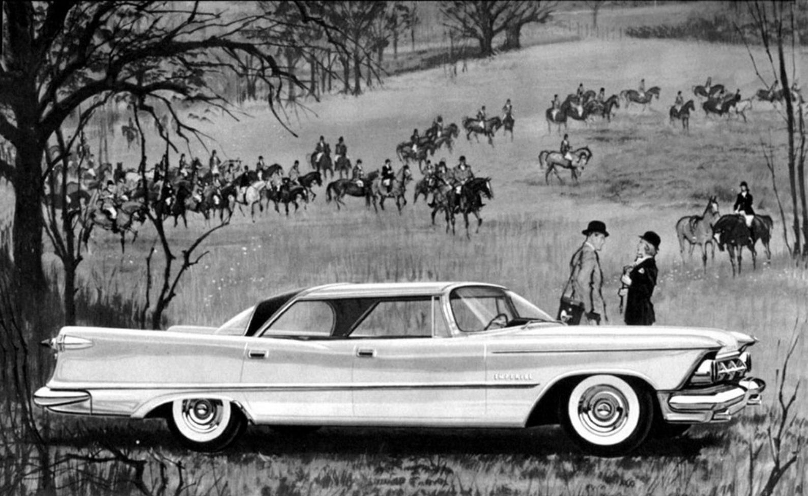
THE IMPERIAL CUSTOM 4-DOOR SOUTHAMPTON WITH NEW SILVERCREST LANDAU ROOF