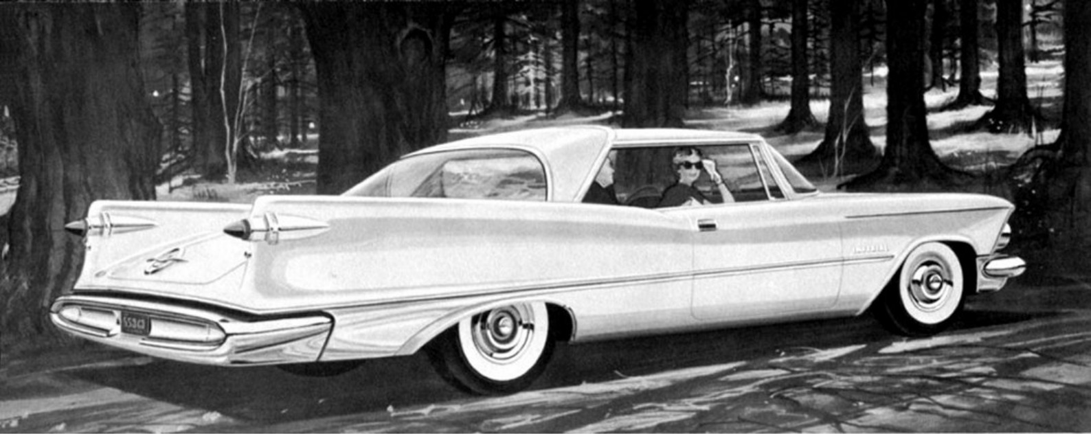
IMPERIAL CUSTOM 2-DOOR SOUTHAMPTON