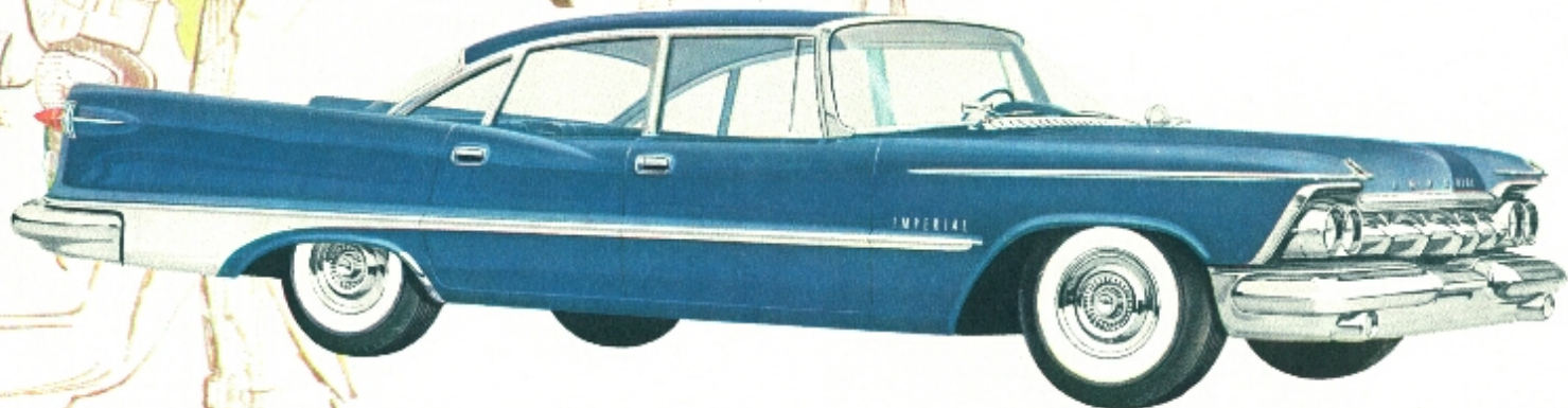
Imperial Custom Four-door Sedan