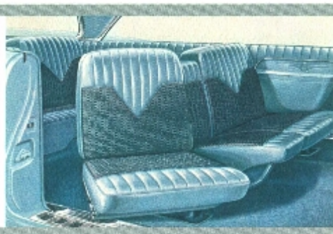
In the fine-car field, only Imperial offers you swivel seats!

Here is just the kind of extra consideration that you'd expect from Imperial—the car that, more than any other, is designed with driver and passengers in mind.