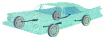
Conventional Coil-Spring Suspension