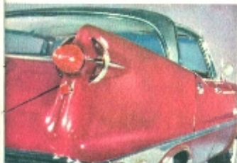
"Goo-sight" taillights— distinctive!

for that Imperial touch of distinguished identity . . .