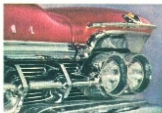
Headlight grouping— deeply sculptured!

for that Imperial look of assured originality . . .