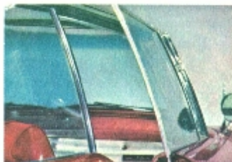
Curved side-windows— exclusive!