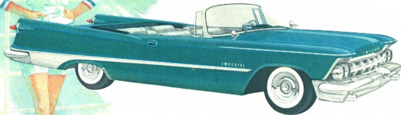
Imperial Crown Convertible