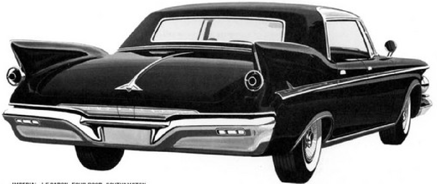
IMPERIAL LE BARON FOUR-DOOR SOUTHAMPTON