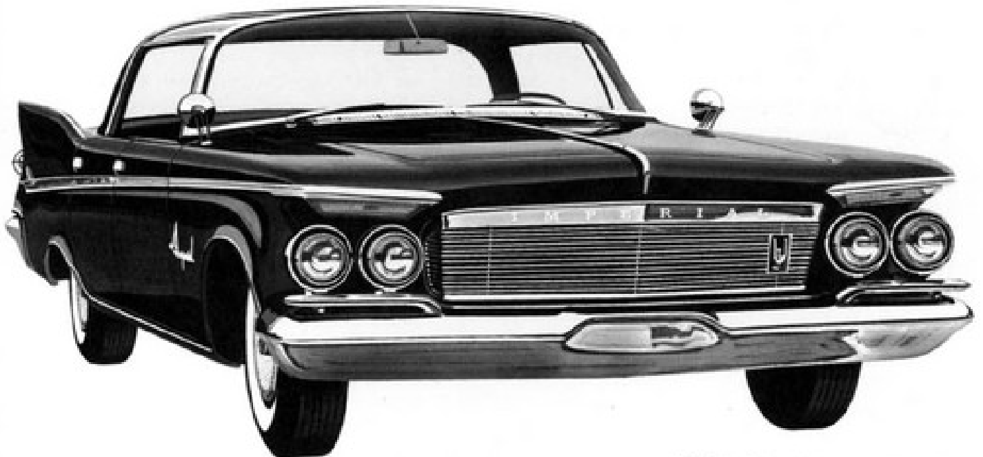
IMPERIAL CROWN FOUR-DOOR SOUTHAMPTON