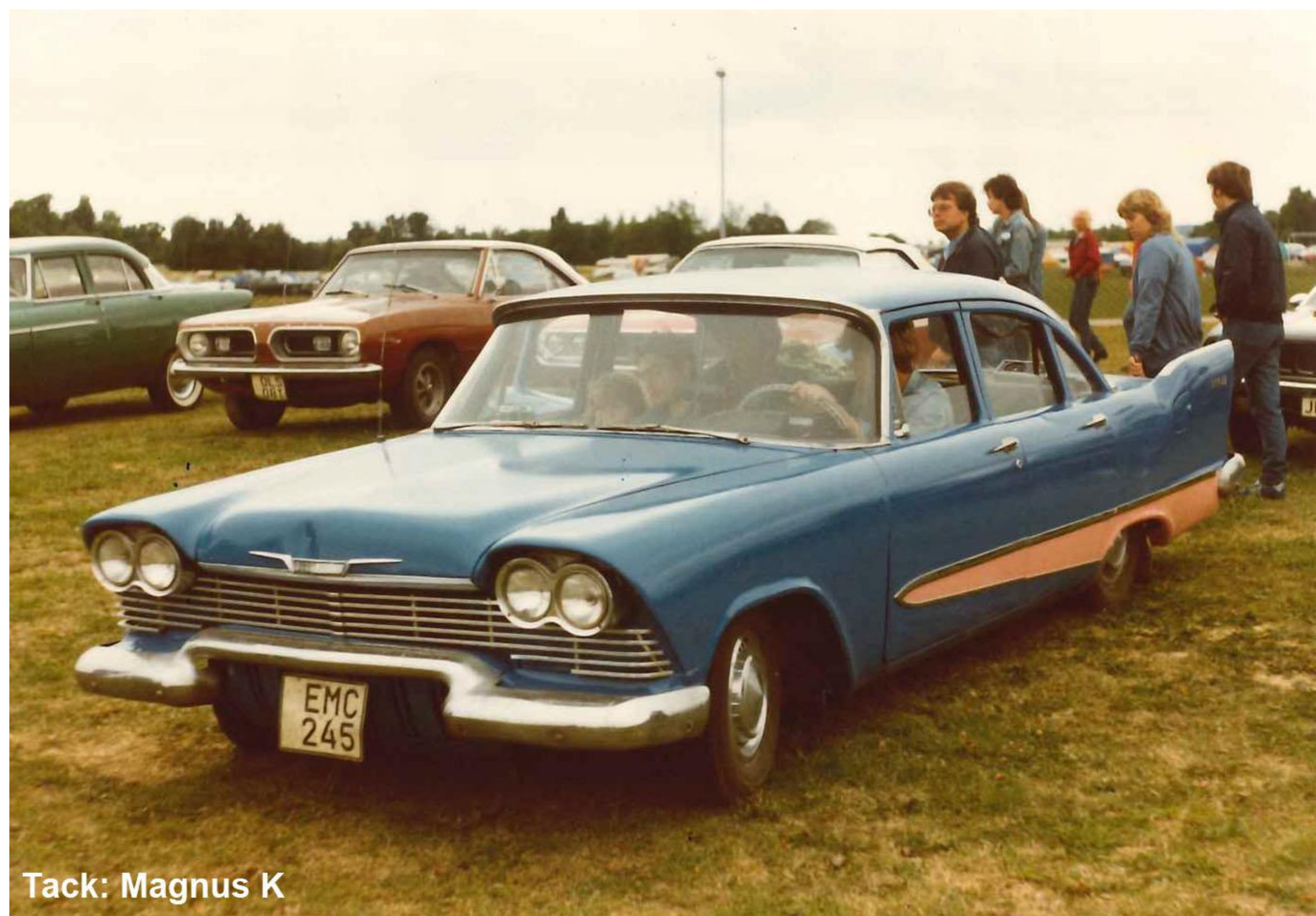
Tack: Magnus K